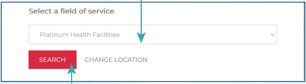
Click on the SEARCH button

Choose a Field of Service e.g., General Practitioners (GPs)